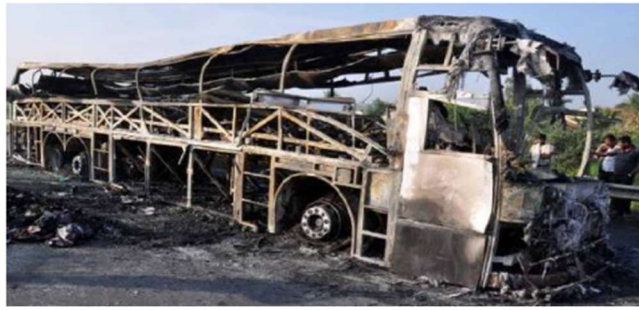
Figure 1. Rollover and fire failure of the bus structure